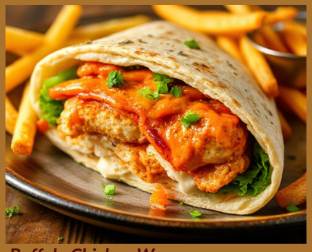
Buffalo Chicken Wrap